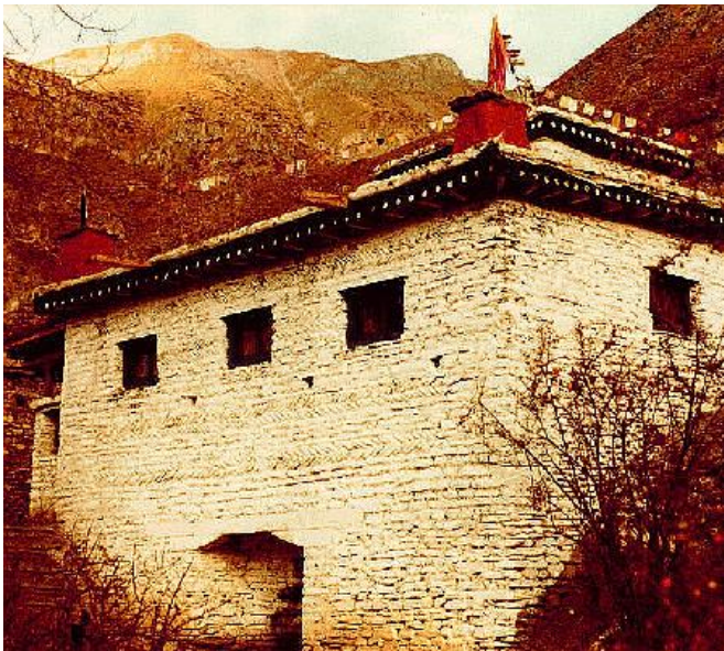
The "Temple Of Miraculous Fire" at Muktinath, Nepal. Photo by Ken Street (Nov. 1979).

[For more on this subject, please read our tract The Temple Of Miraculous Fire .]